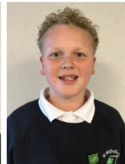
Archie Head Boy